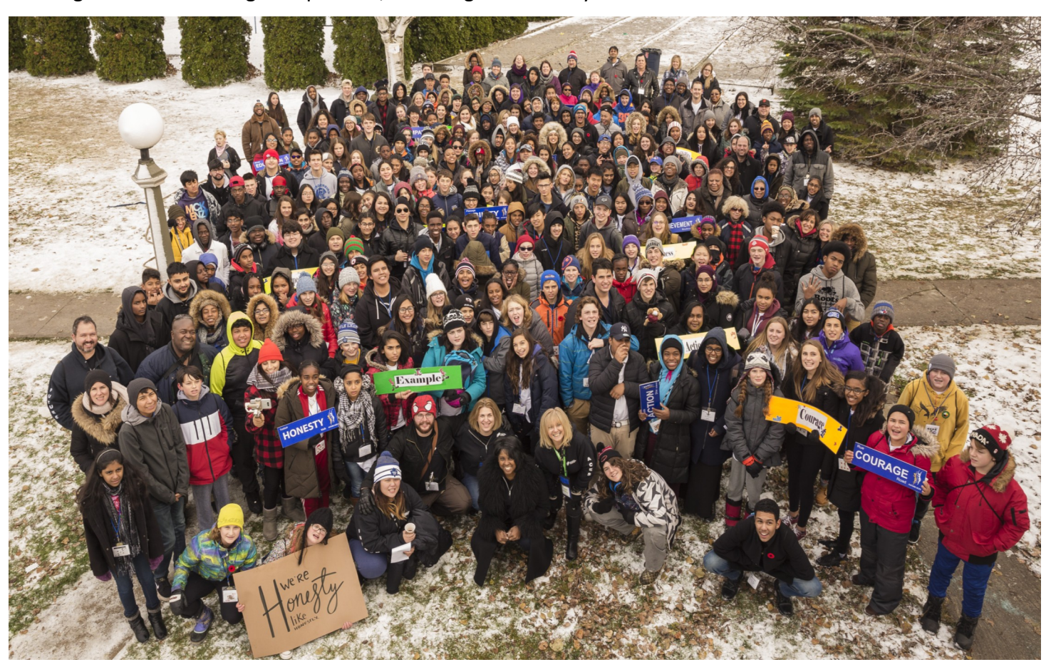
Letter from a Student who attended the conference

Of our several education initiatives, the leadership conference is being highlighted in this report. A Conference Empowering Self is a three-day leadership opportunity for students in Grades 7 to 10 that focuses on self-awareness and self-efficacy, leadership development, empowerment and a call to action for the implementation of school and community service projects. Students are highly subsidized, as the conference is supported by funding from a broad range of sponsors, including the Ministry of Education.